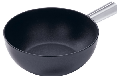
Fondue pot Induction aluminium Ø 22 cm ● black 32007