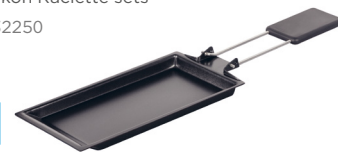
Mini Raclette pan for Kuhn Rikon Raclette sets ● black 19152