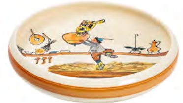
Children's plate Ursli gets the bell Ø 18 cm high rim 39513