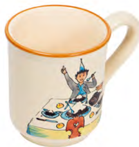
Mug Ursli at the table 2.8 dl 39453