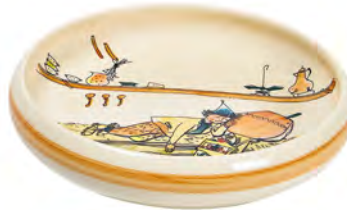
Children's plate Ursli is sleeping on the bell Ø 18 cm high rim 39515