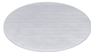
Transmission plate aluminium Our recommendation for a quick and optimal heat distribution in our ceramic fondue pots. Ø 15 cm ● aluminium 32045