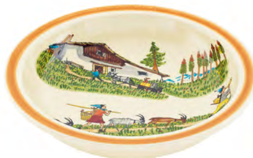
Bowl Mountain chalet Ø 29 cm high rim 39014