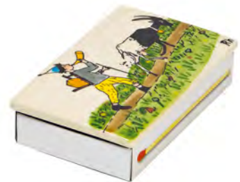
Box of matches big Ursli with goat 11.5x7cm 39716