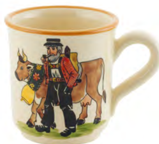
Mug Appenzell 2.8 dl 39461