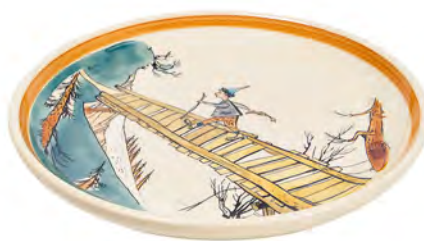
Plate Ursli on the bridge Ø 21 cm 39117