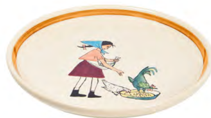
Plate Flurina Ø 21 cm 39127