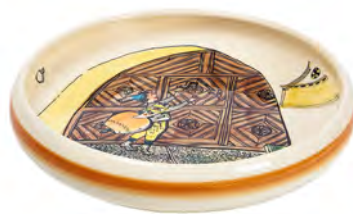
Children's plate Ursli at the door Ø 18 cm high rim 39511