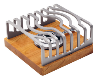
Rechaud* Modern ● silver/cherry wood 32098