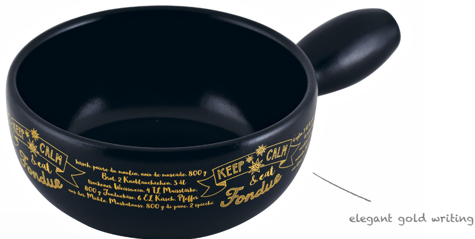
elegant gold writing

Fondue pot Handlettering Ø 22 cm ● black 32257