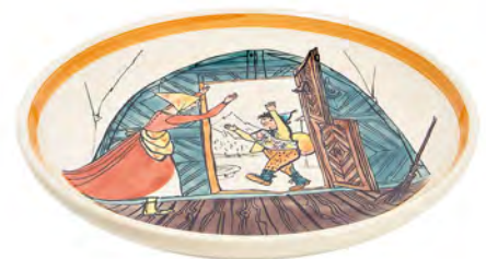
Plate Ursli is coming home Ø 21 cm 39118