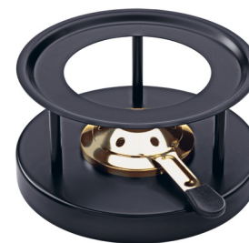
Rechaud* Simple with gold burner ● black powder-coated 32263