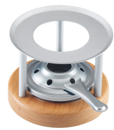
Mini-Rechaud* Melchterli ● grey/cherry wood 32244