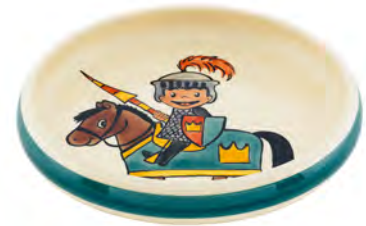
Children's plate Knight Ø 18 cm high rim 39522