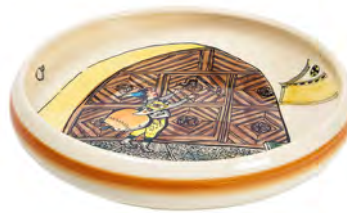
Children's plate Ursli at the door Ø 18 cm high rim 39511