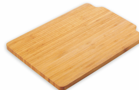
Cutting board 34x24x1.5cm ● bamboo 22258