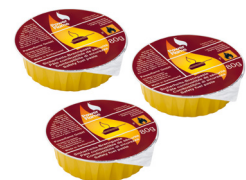
Fuel paste for Kuhn Rikon burners 3 pieces à 80 g 32043