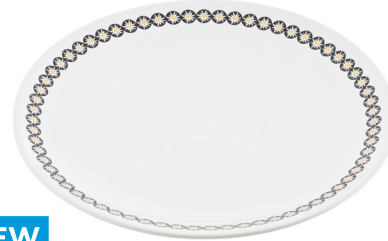
NEW Plate Golden Bell Ø 20 cm ○ white 32253