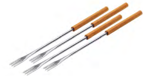
Cheese and meat fondue forks 4 pieces ● cherry wood 32099