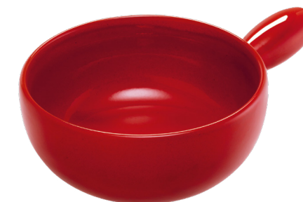
Fondue pot Classic Ø 22 cm ● red 32185