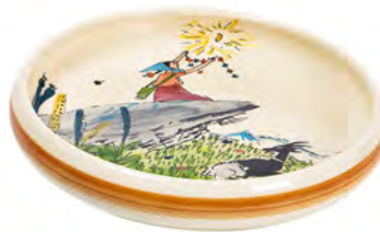
Children's plate Flurina on the rock Ø 18 cm high rim 39516