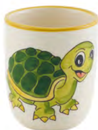
Children's cup Turtle 2.0 dl 39328