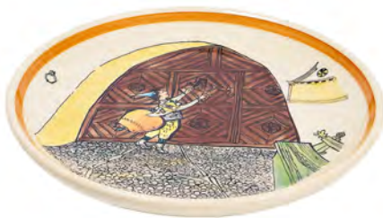
Plate Ursli at the door Ø 21 cm 39116