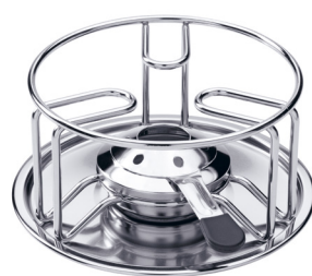
Rechaud* Wire ● stainless steel 32017