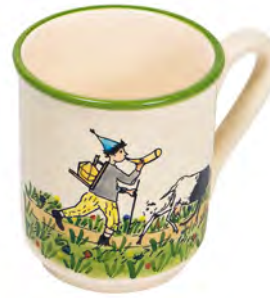
Mug Ursli with goat 2.8 dl 39455