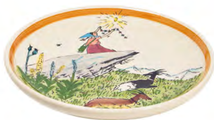
Plate Flurina on the rock Ø 21 cm 39107