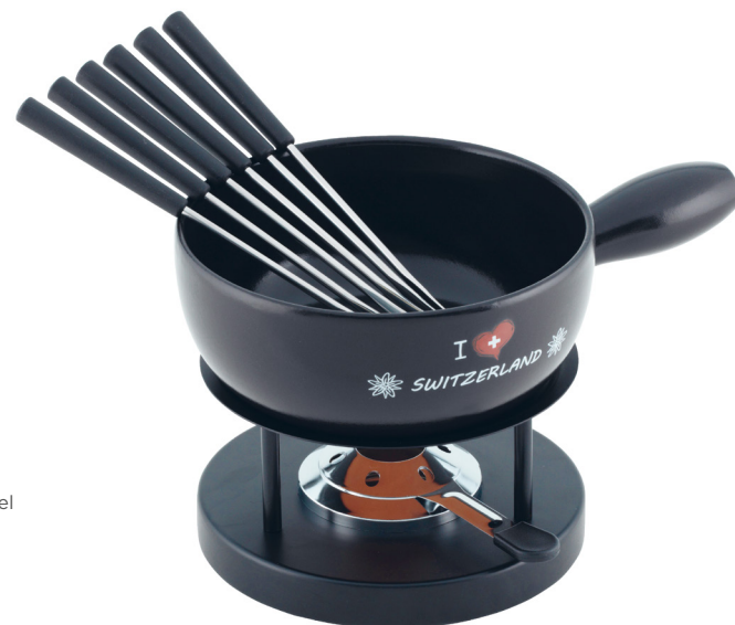
Cheese fondue set «I love Switzerland» incl. fondue pot, rechaud* Simple, 6 plastic forks black, filled fuel paste burner. Ø 22 cm ● black 32242