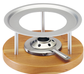
Rechaud* Melchterli ● grey/cherry wood 32059