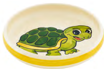
Children's plate Turtle Ø 18 cm high rim 39526