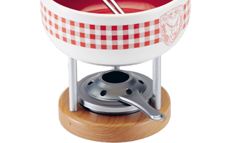
Mini-Cheese Fondue Set Caro Deer for 2 persons incl. fondue pot, mini-rechaud*, 2 forks with cherry wood handles, filled fuel paste burner. Ø 16 cm ● white/red* 32207