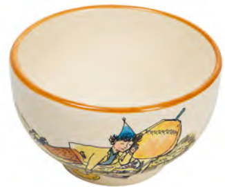
Bowl small Ursli is sleeping on the bell Ø 14 cm 39485