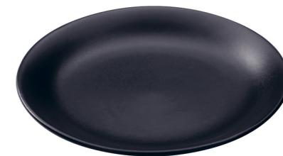
Plate Classic Ø 20 cm ● black 32082