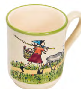
Mug Flurina with goat 2.8 dl 39450