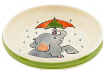
Children's plate Elephant Ø 18 cm high rim 39525