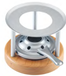
Mini Rechaud* Melchterli ●● grey/cherry wood 32244