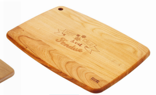
NEW Cutting board Handlettering 36x25x15 cm ● cherry wood 32259