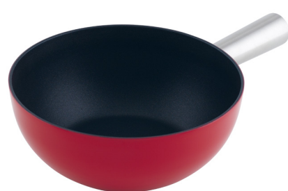
Fondue pot Induction aluminium Ø 22 cm ● red 32249