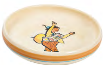
Children's plate Ursli Ø 18 cm high rim 39509