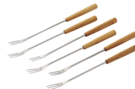
Cheese fondue forks 6 pieces ● bamboo 32205