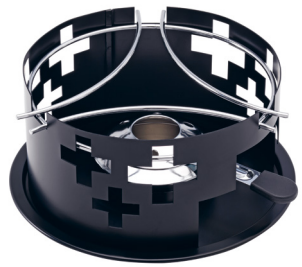
Rechaud* Swiss Cross ● black powder-coatedpoudre 32198