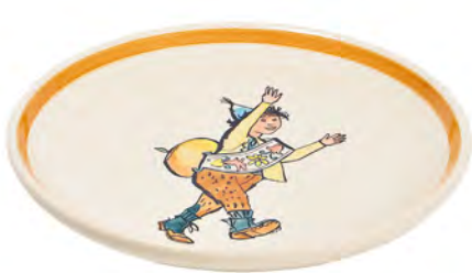
Plate Ursli Ø 21 cm 39120