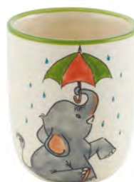
Children's cup Elephant 2.0 dl 39327