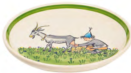
Plate Ursli with goat Ø 21 cm 39126