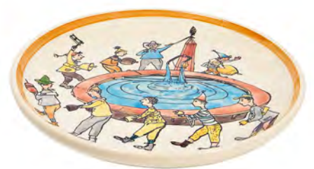
Plate Ursli Dance by the fountain Ø 21 cm 39106