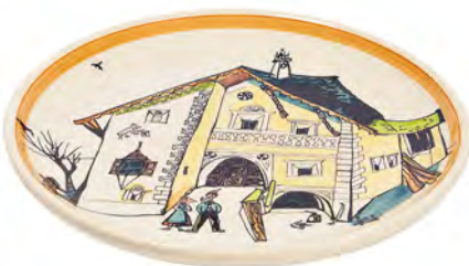
Plate Ursli at home with parents Ø 21 cm 39122