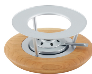
Rechaud* cherry wood with silver-coloured burner matt ● silver/cherry wood 32239