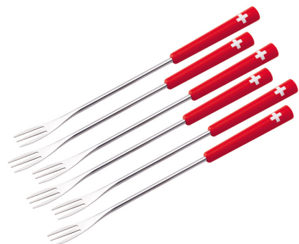
Cheese fondue forks Swiss Cross 6 pieces ● plastic red/decor Swiss Cross 32206