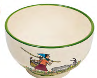
Bowl small Flurina with goat Ø 14 cm 39481