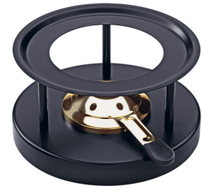
Rechaud* Simple with gold burner ● black powder-coatedpoudre 32263