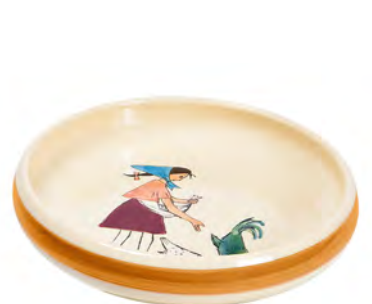
Children's plate Flurina Ø 18 cm high rim 39517