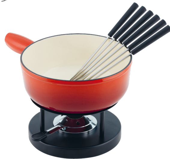
Cheese fondue set cast iron incl. fondue pot, rechaud* Simple, 6 plastic forks black, filled fuel paste burner. Ø 24 cm ● red* 32236