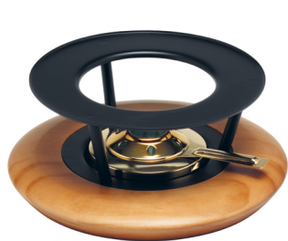
Rechaud* cherry wood ● black/cherry wood 32042