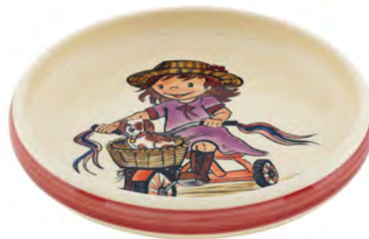
Children's plate Bicycle Ø 18 cm high rim 39520