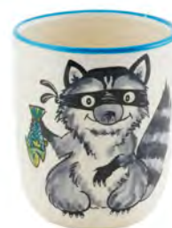
Children's cup Racoon 2.0 dl 39329