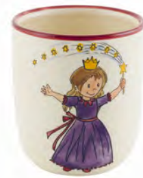
Children's cup Princess 2.0 dl 39321