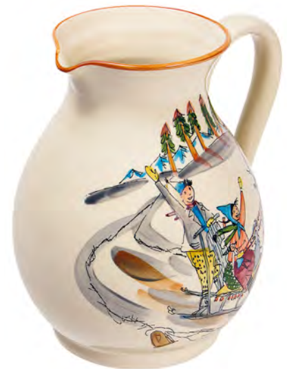
Jug Sleigh ride