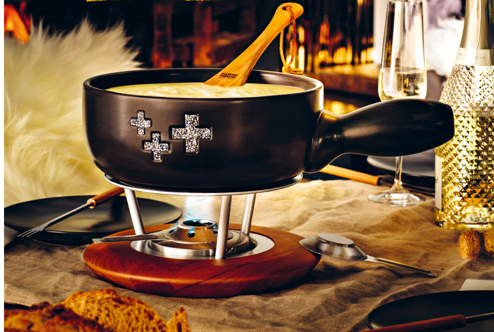
swiss crosses refined with crystals

Fondue pot Induction refined with crystals Ø 23 cm ● black 32245