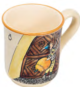
Mug Ursli at the door 2.8 dl 39454