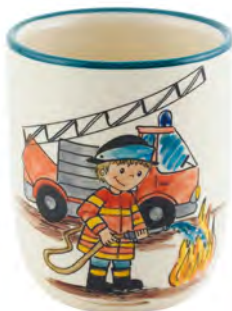
Children's cup Fireman 2.0 dl 39323