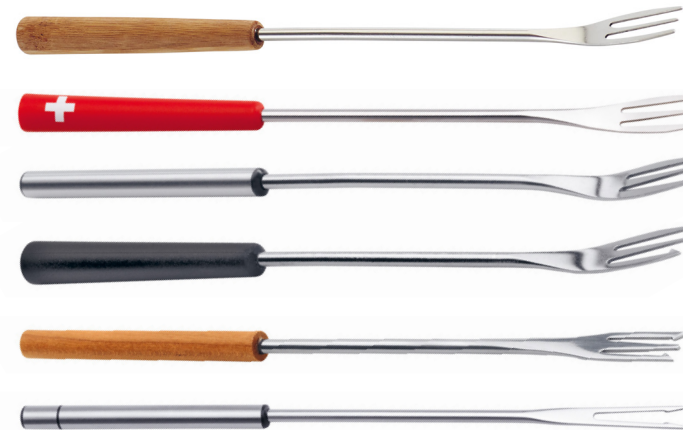
Cheese fondue forks 6 pieces ● bamboo 32205