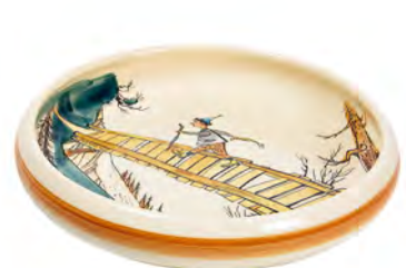
Children's plate Ursli on the bridge Ø 18 cm high rim 39512