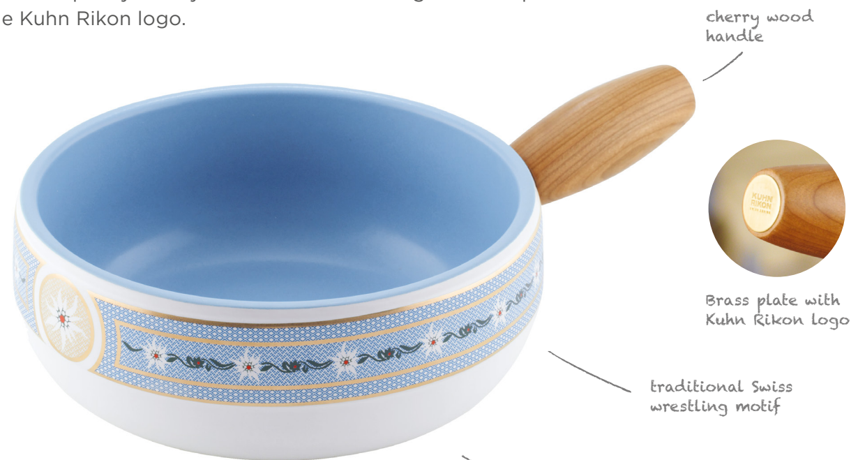
Fondue pot Induction Schwinger Ø 20 cm ○ white 32233

Ancient Swiss design, reinterpreted. This design was inspired by traditional light blue edelweiss shirts. Fractured white glaze on the exterior with typical edelweiss trim, inspired by the popular Swiss farmer and wrestler shirts. Interior in corresponding light blue glaze. With a premium quality cherry wood handle and elegant brass plate bearing the Kuhn Rikon logo.