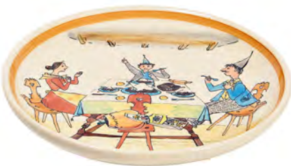
Plate Ursli at the table Ø 21 cm 39115