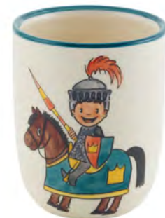
Children's cup Knight 2.0 dl 39324