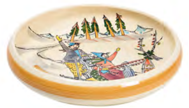
Children's plate Sleigh ride Ø 18 cm high rim 39508