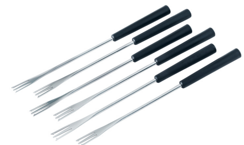
Cheese and meat fondue forks 6 pieces ● plastic fork 32039