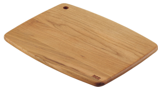
Cutting board cherry wood oiled 36x28x1.5cm ● cherry wood 35031