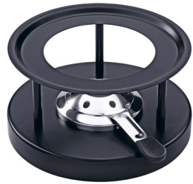
Rechaud* Simple ● black powder-coatedpoudre 32019