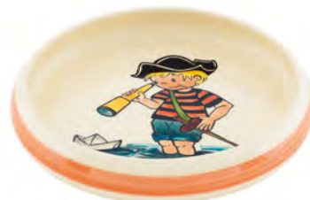
Children's plate Pirate boy Ø 18 cm high rim 39523