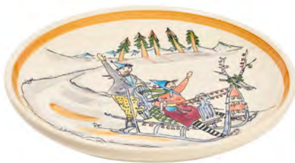
Plate Sleigh ride