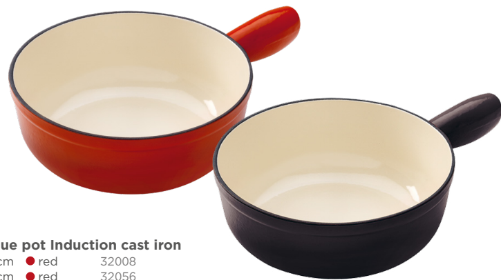
Fondue pot Induction cast iron Ø 20 cm ● red 32008 Ø 24 cm ● red 32056 Ø 20 cm ● black 32221 Ø 24 cm ● black 32209