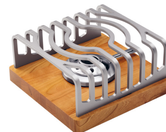
Rechaud* Modern ● silver/cherry wood 32098