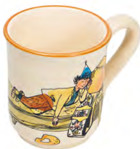
Mug Ursli is sleeping on the bell 2.8 dl 39456