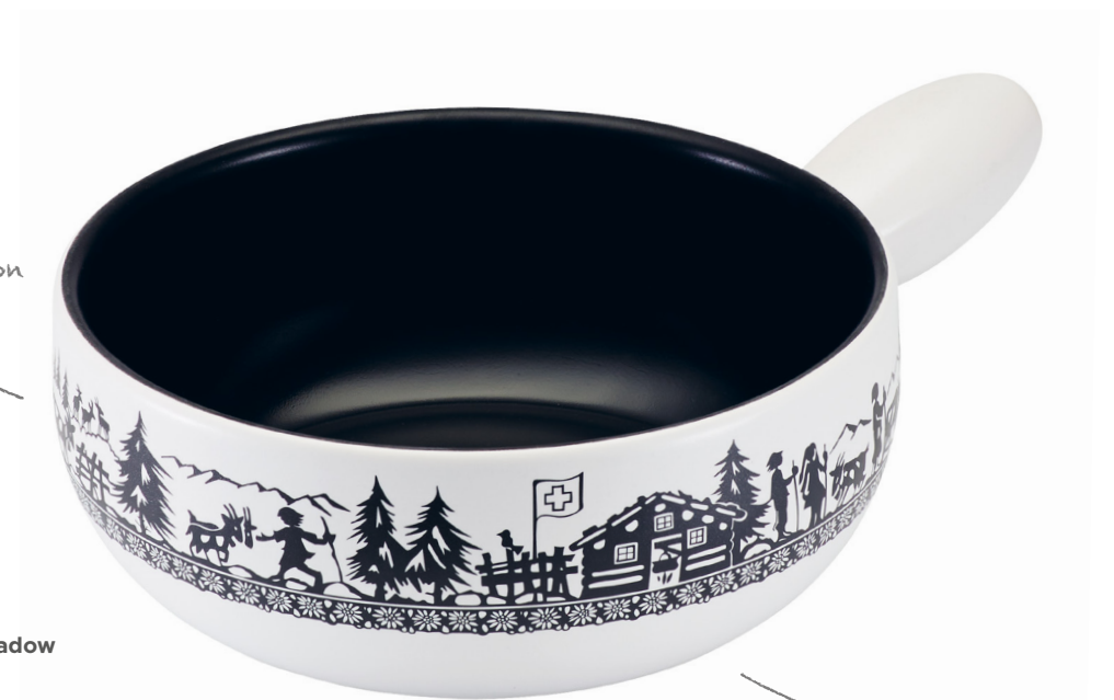
Fondue pot Induction Alpine Meadow Ø 23 cm ● white/black 32158

a silhouette decoration of the traditional «Alpine meadow»