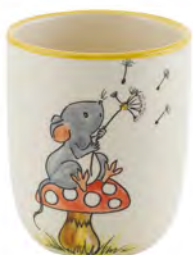
Children's cup Mouse 2.0 dl 39326