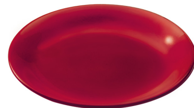
Plate Classic Ø 19 cm ● red 32091