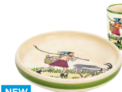
NEW Children's set Flurina with goat Children's plate Ø 18 cm high rim and children's cup 2.0 dl 39542