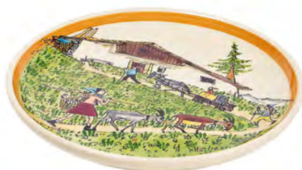
Plate Ursli and Flurina mountain chalet Ø 21 cm 39114