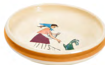
Children's plate Flurina Ø 18 cm high rim 39517