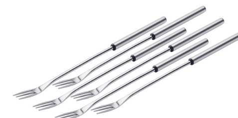
Cheese fondue forks 6 pieces ● stainless steel 32040