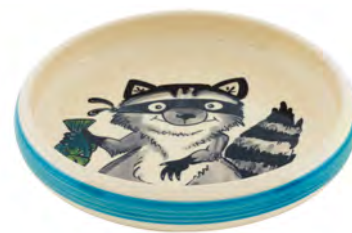
Children's plate Racoon Ø 18 cm high rim 39527