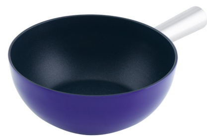
Fondue pot Induction aluminium Ø 22 cm ● violet 32248