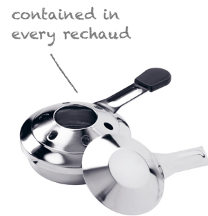
Paste burner filled with fuel paste 32046