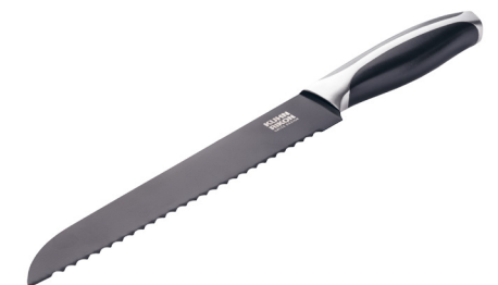
Black Peak bread knife 33 cm ● black 24018