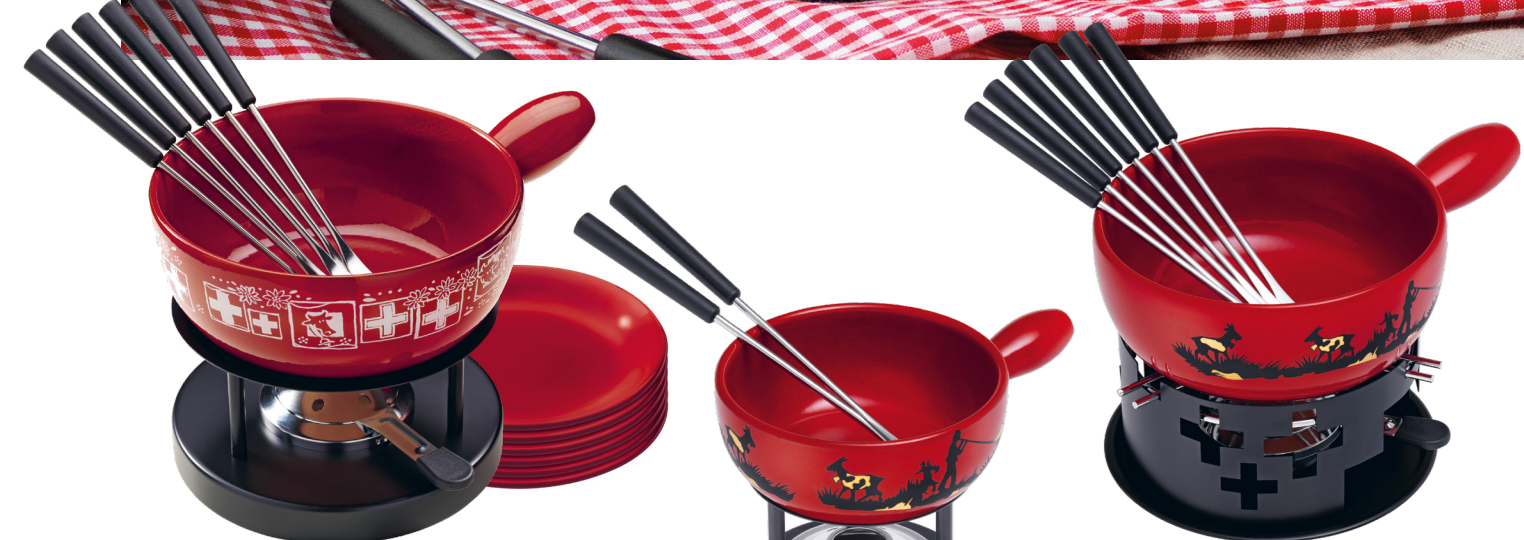
Cheese fondue set Suisse incl. fondue pot, rechaud*, 6 plastic forks black, 6 plates red, filled fuel paste burner. Ø 22 cm ● red* 32010