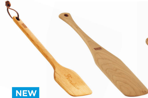
NEW Spatula Handlettering 30x6 cm ● cherry wood 32260