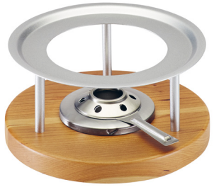
Rechaud* Melchterli ● grey/cherry wood 32059