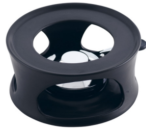
Rechaud* Kuhn Rikon Swiss Design ● black/ceramic 32246