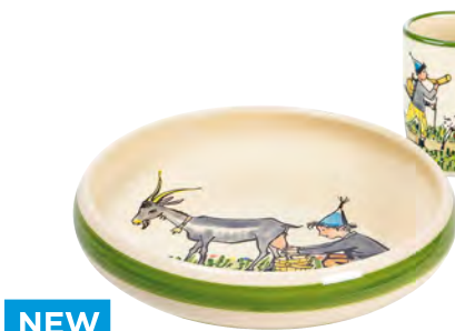
NEW Children's set Ursli with goat Children's plate Ø 18 cm high rim and children's cup 2.0 dl 39541