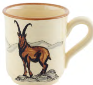
Mug Capricorn 2.8 dl 39460