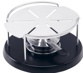
Rechaud* Special with heat distributor aluminium ● powder-coated 32199