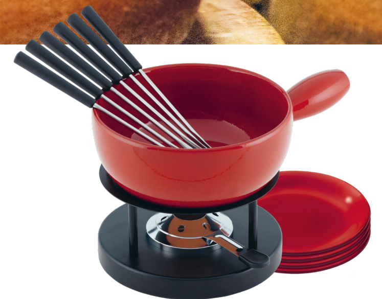
Cheese fondue set Classic incl. fondue pot, rechaud Simple*, 6 plastic forks black, 4 plates red, filled fuel paste burner. Ø 22 cm ● red 32066