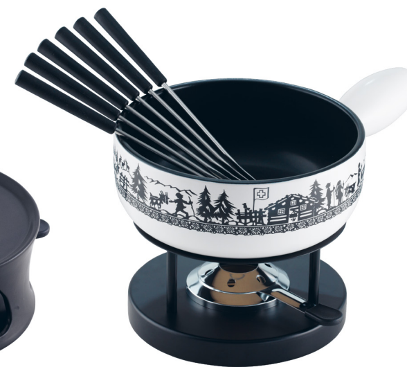
Fondue set Induction Alpine Meadow incl. fondue pot, rechaud* Simple, 6 plastic forks black, filled fuel paste burner. Ø 23 cm ● white/black 32235