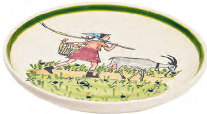
Plate Flurina with goat Ø 21 cm 39125