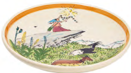
Plate Flurina on the rock Ø 21 cm 39107