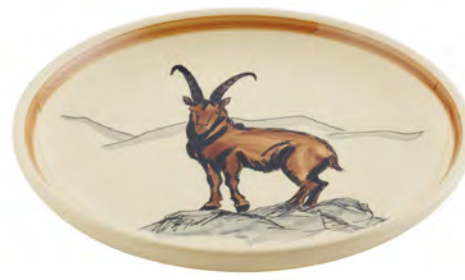
Plate Capricorn Ø 21 cm 39128