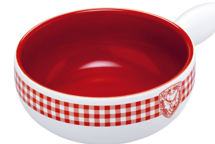
Fondue pot Induction Caro Deer Ø 23 cm ● white/red 32181