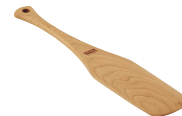
Spatula cherry wood oiled 33x6.5cm ● cherry wood 35030