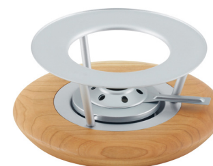
Rechaud* cherry wood with matt silver burner ● cherry wood 32239