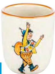
Children's cup Ursli 2.0 dl 39340