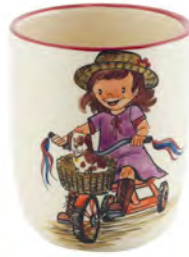
Children's cup Bicycle 2.0 dl 39322