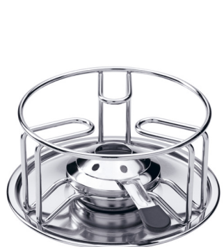
Rechaud* Wire ● stainless steel 32017