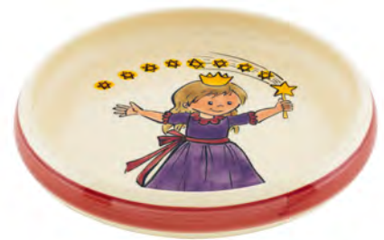
Children's plate Princess Ø 18 cm high rim 39519