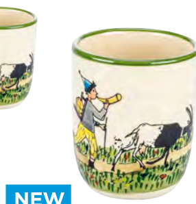
NEW Children's cup Ursli with goat 2.0 dl 39341