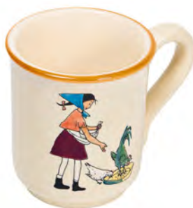
Mug Flurina 2.8 dl 39459