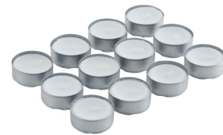
Candle set for Kuhn Rikon Raclette sets 12 pieces 32250