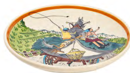
Plate Ursli and Flurina on the hay cart Ø 21 cm 39113