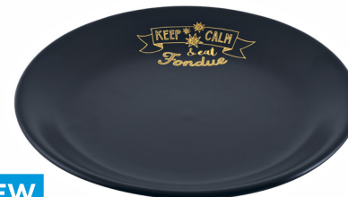
NEW Plate Handlettering Ø 19 cm ● black 32258