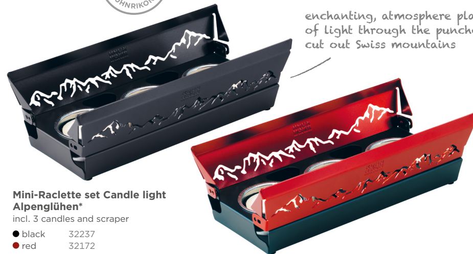
Mini-Raclette set Candle light Alpenglühen* incl. 3 candles and scraper ● black 32237 ● red 32172

enchanting, atmosphere play of light through the punched cut out Swiss mountains