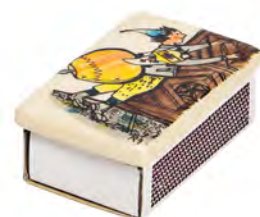
Box of matches small Ursli at the door 6.3x4cm 39702