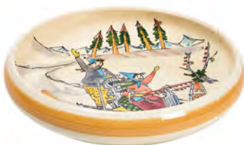
Children's plate Sleigh ride