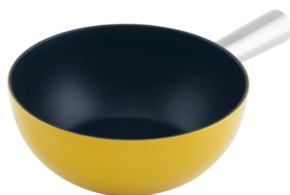
Fondue pot Induction aluminium Ø 22 cm ● gold 32264