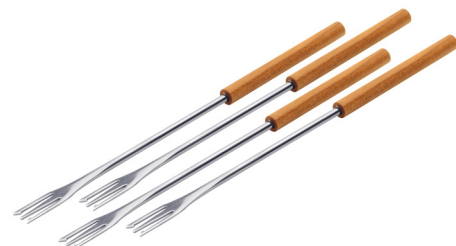
Cheese and meat fondue forks 4 pieces ● cherry wood 32099