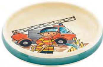
Children's plate Fireman Ø 18 cm high rim 39521