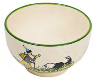
Bowl small Ursli with goat Ø 14 cm 39484