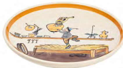
Plate Ursli gets the bell Ø 21 cm 39119