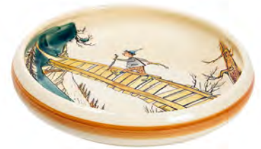
Children's plate Ursli on the bridge Ø 18 cm high rim 39512