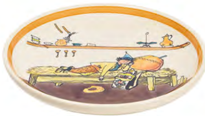
Plate Ursli is sleeping on the bell Ø 21 cm 39121