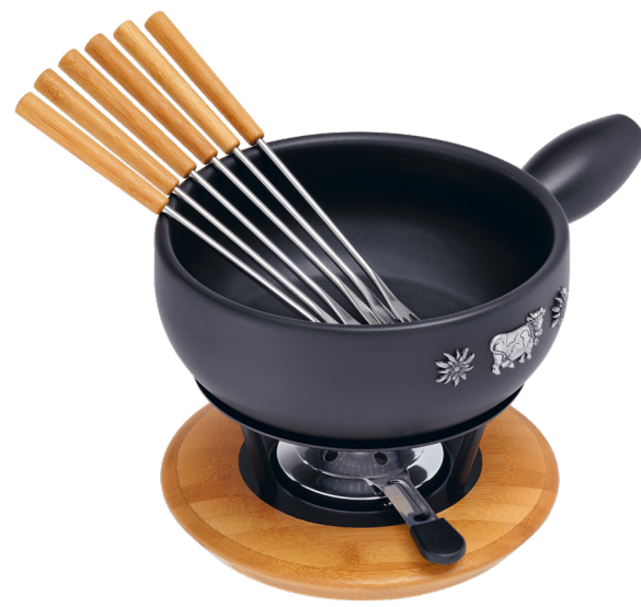
Cheese fondue set Alpina incl. fondue pot, rechaud* pine wood, 6 forks with bamboo handles, filled fuel paste burner. Ø 23 cm ● black/decor stainless steel application* 32089