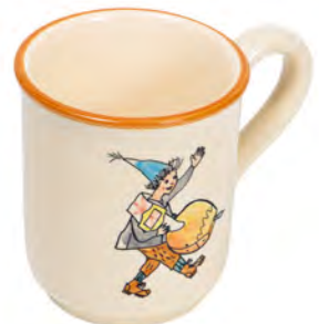
Mug Ursli 2.8 dl 39452