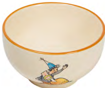
Bowl small Ursli Ø 14 cm 39483