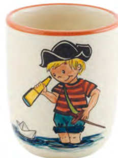
Children's cup Pirate boy 2.0 dl 39325