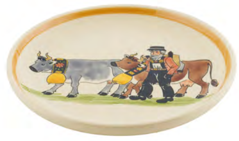
Plate Appenzell Ø 21 cm 39129