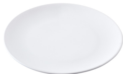
Plate Classic Ø 20 cm ○ white 32223