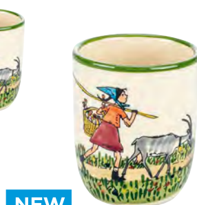
NEW Children's cup Flurina with goat 2.0 dl 39342