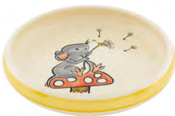
Children's plate Mouse Ø 18 cm high rim 39524