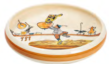
Children's plate Ursli gets the bell Ø 18 cm high rim 39513