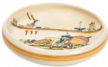
Children's plate Ursli is sleeping on the bell Ø 18 cm high rim 39515