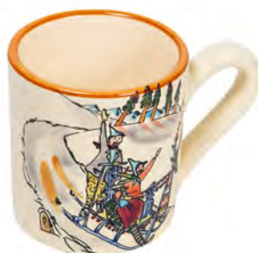
Mug Sleigh ride