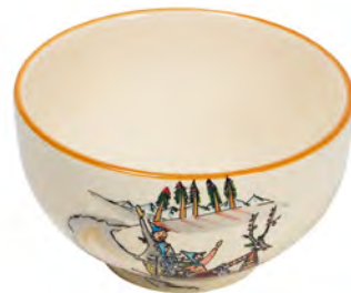
Bowl small Sleigh ride