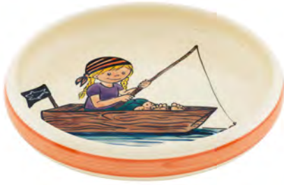
Children's plate Pirate girl Ø 18 cm high rim 39518