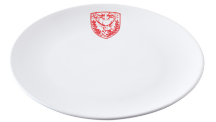
Plate Caro Deer Ø 20 cm ○ white/decor deer 32191