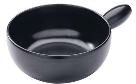
Fondue pot Induction Classic Ø 23 cm ● black 32189