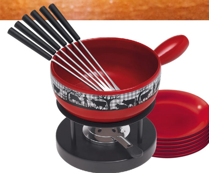
Cheese fondue set Caro Cow incl. fondue pot, rechaud Simple*, 6 plastic forks black, 6 plates red, filled fuel paste burner. Ø 22 cm ● red 32047