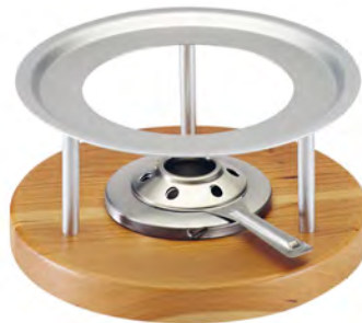
Rechaud* Melchterli ●● grey/cherry wood 32059