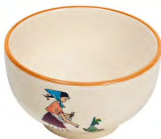
Bowl small Flurina Ø 14 cm 39486