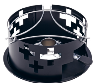
Rechaud* Swiss Cross ● black powder-coatedpoudre 32198