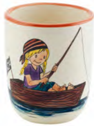
Children's cup Pirate girl 2.0 dl 39320